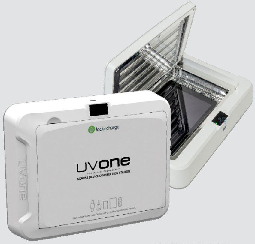
15" (L) x 4.5" (W) x 12" (H) | 10.68 lbs